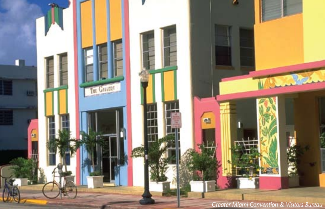
Greater Miami Convention & Visitors Bureau

Explore South Beach, just five miles from Canyon Ranch Hotel & Spa.