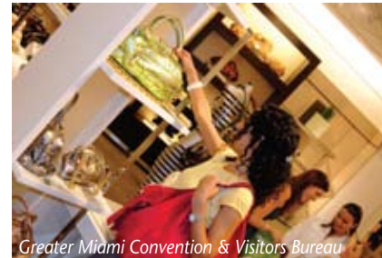
Greater Miami Convention & Visitors Bureau

Your group stay at Canyon Ranch Hotel & Spa in Miami Beach will be unforgettable and hassle-free – and each person will go home feeling special.