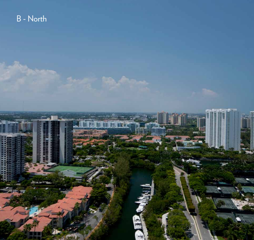
B - North